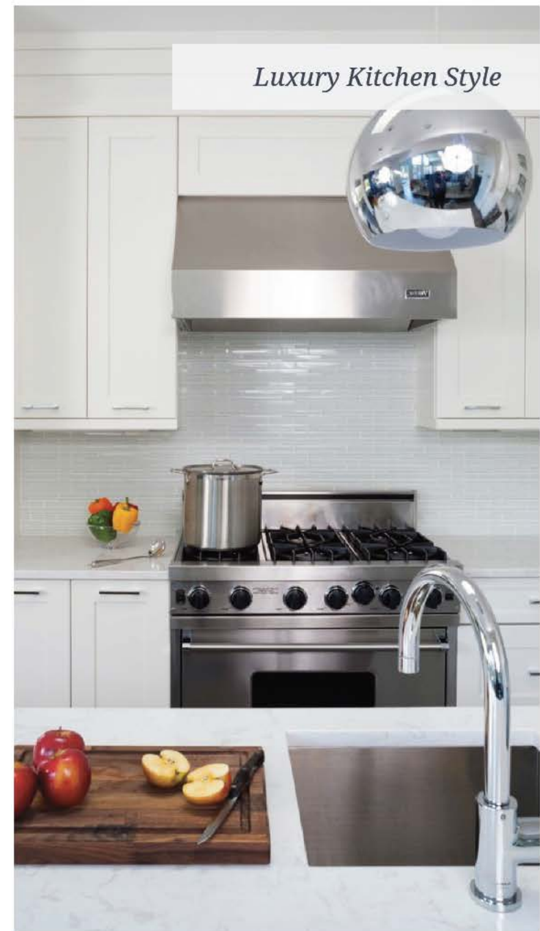
Luxury Kitchen Style

When it comes to appliances, choose sleek stainless steel options that harmonize with the custom cabinetry, featuring simple cuts and minimal hardware. To enhance the overall cohesion of the room, consider matching the hardware color to that of the appliances. This approach will create a unified flow within the space, avoiding a disjointed appearance of disparate elements haphazardly placed together.