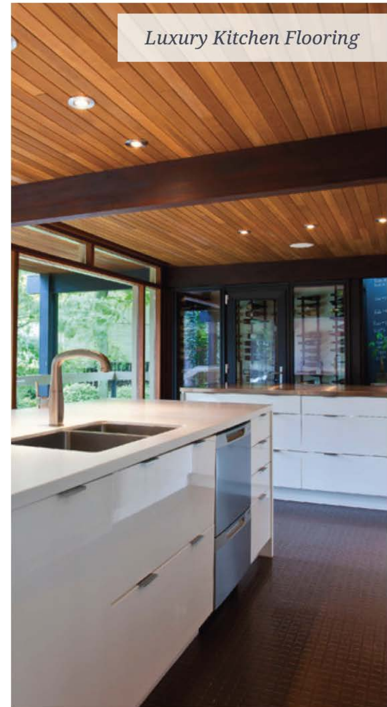
Luxury Kitchen Flooring

Kitchen floors are prone to spills and dirt, so select a flooring material that is easy to clean and maintain. Opt for a nonporous surface that resists staining and is resistant to the effects of frequent cleaning.